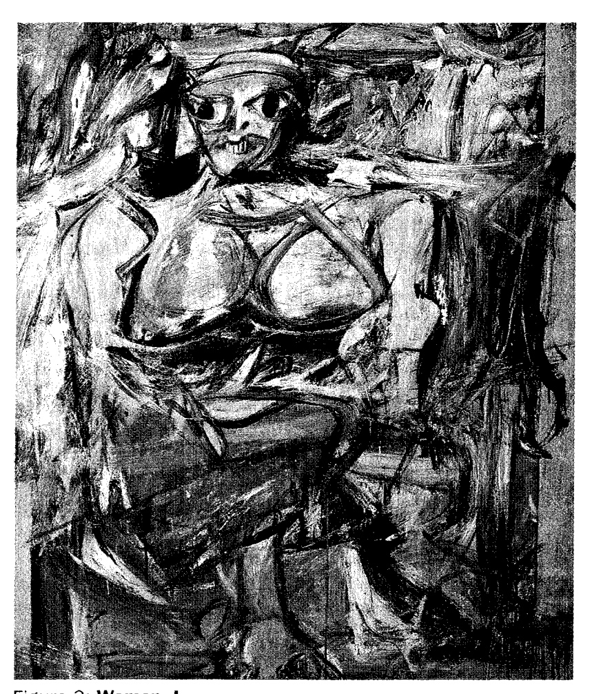
Figure 3: Woman, I Oil on canvas, 1950–52. 1\cdot9\times1\cdot5 m. The Museum of Modern Art, New York. Purchase.

Stopping the alcohol, improving nutrition, and assuring rest and sleep,<sup>14</sup> and treating secondary causes such as hypothyroidism and vitamin deficiencies, may improve reversible components of dementia.<sup>14</sup> Memory aids, writing of names, listing of chores, and surrounding patients with familiar objects, help them to find their