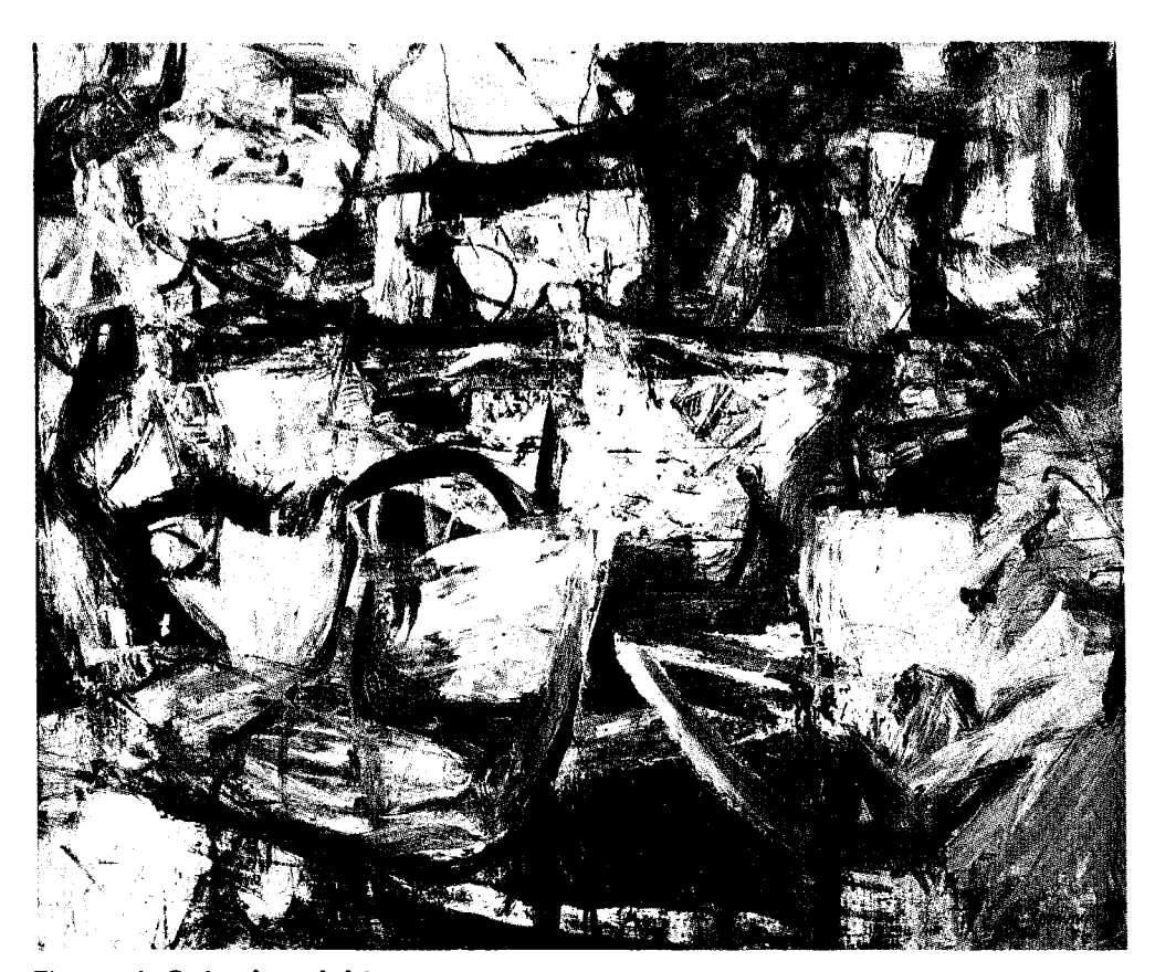
Figure 4: Saturday night Oil on canvas, 1.7 \times 2.0 m. Washington University Gallery of Art, St Louis. University Purchase, Bixby Fund, 1956