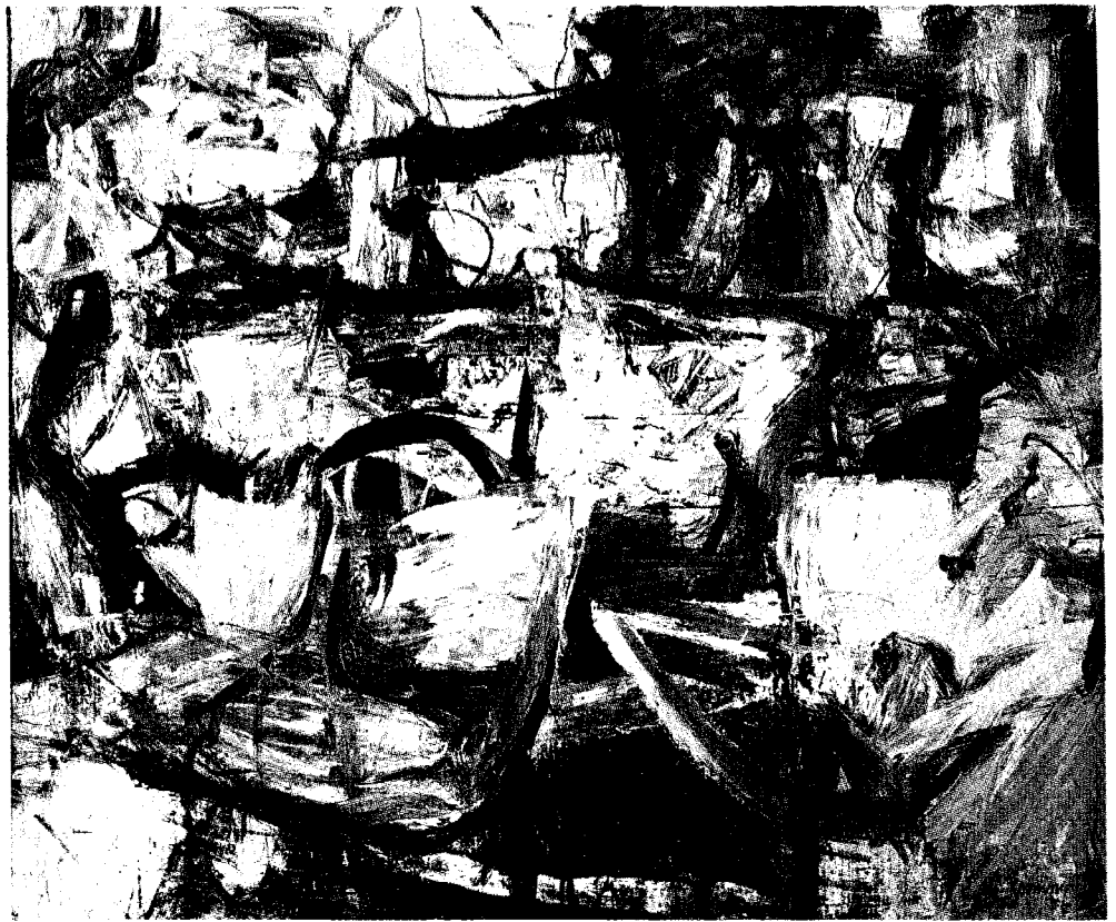
Figure 4: Saturday night

Oil on canvas, 1.7 × 2.0 m. Washington University Gallery of Art, St Louis. University Purchase, Bixby Fund, 1956