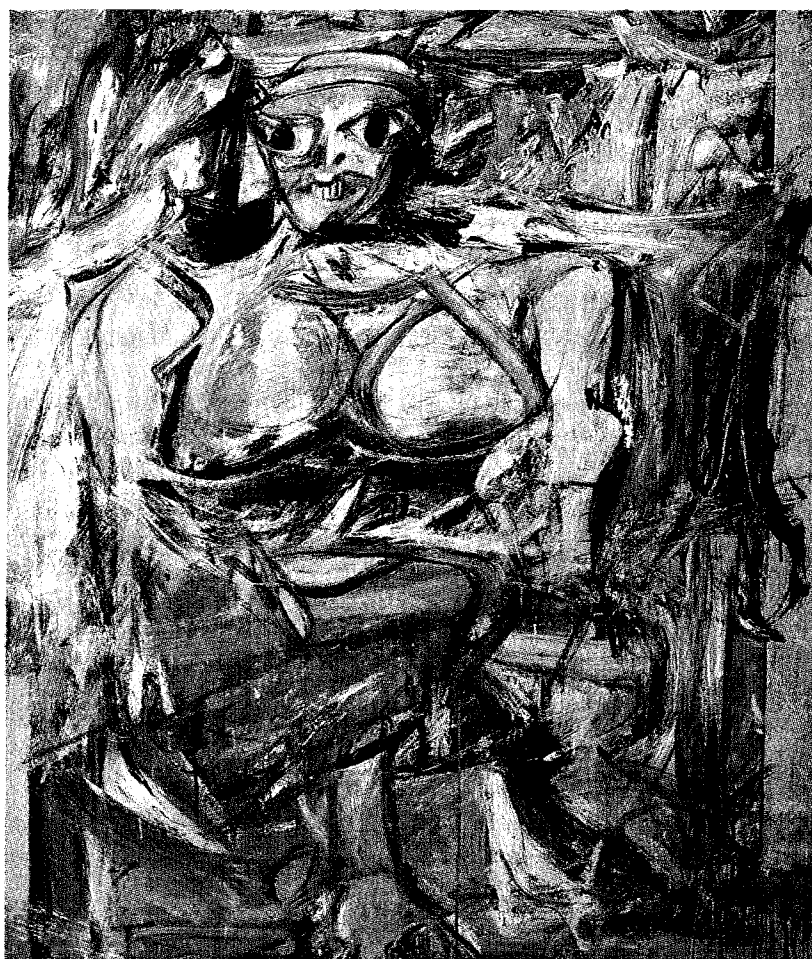
Figure 3: Woman, I

Stopping the alcohol, improving nutrition, and assuring rest and sleep, 14 and treating secondary causes such as hypothyroidism and vitamin deficiencies, may improve reversible components of dementia. 14 Memory aids, writing of names, listing of chores, and surrounding patients with familiar objects, help them to find their