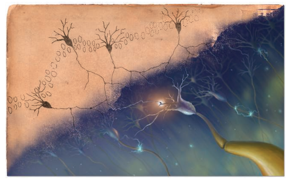
Information processing, past and present. The Neuron Doctrine transformed the 19th-century view of the nervous system which saw the brain as a network of interconnected nerve fibers (upper left). A century later, the modern view (lower right) holds the neuron as a discrete cell that processes information in more ways than original envisaged: Intercellular communication by gap junctions, slow electrical potentials, action potentials initiated in dendrites, neuromodulatory effects, extrasynaptic release of neurotransmitters, and information flow between neurons and glia all contribute to information processing.

rather than all-or-nothing electrical spikes that propagate regeneratively (2). It was also determined that evoked electrical responses often occur on a background of spontaneous changes in membrane potential (i.e., produced without input from other neurons) and that some parts of the neuron are incapable of producing all-ornothing action potentials (3). Today, it is apparent that information processing in the nervous system must operate beyond the limits of the Neuron Doctrine as it was conceived. This has evolved from detailed information gained from techniques devel-